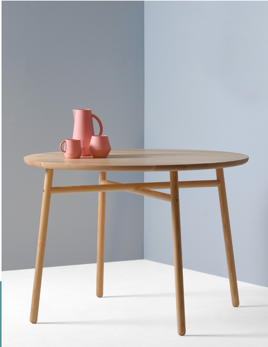
Fafa Table - round