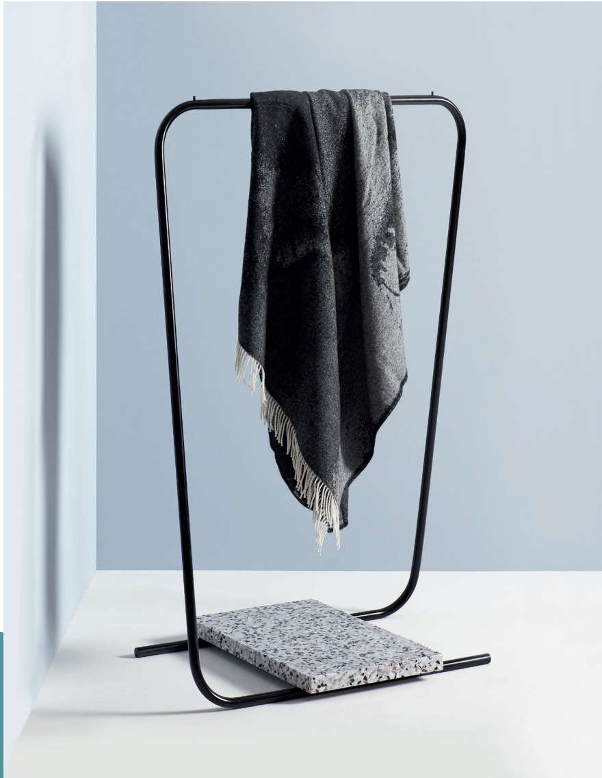
Fil 'Black' with terrazzo stone